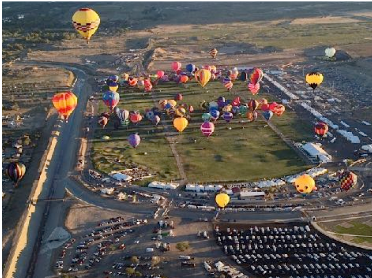
Airstreams at the Balloon Fiesta