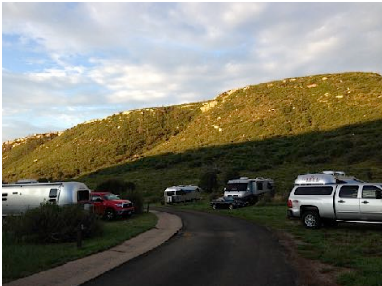
Campground at Mesa Verde National park