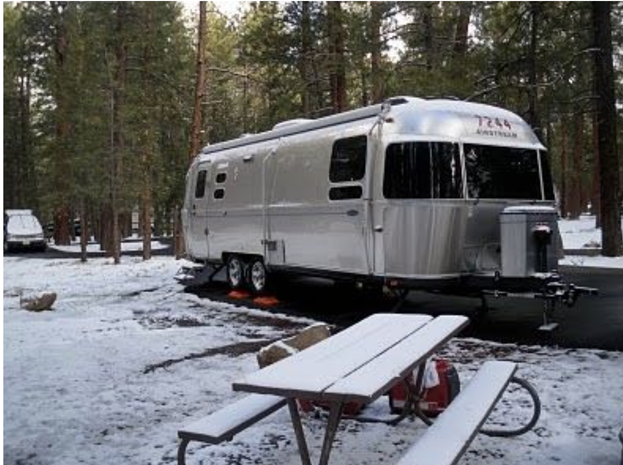
North Rim of the Grand Canyon National Park