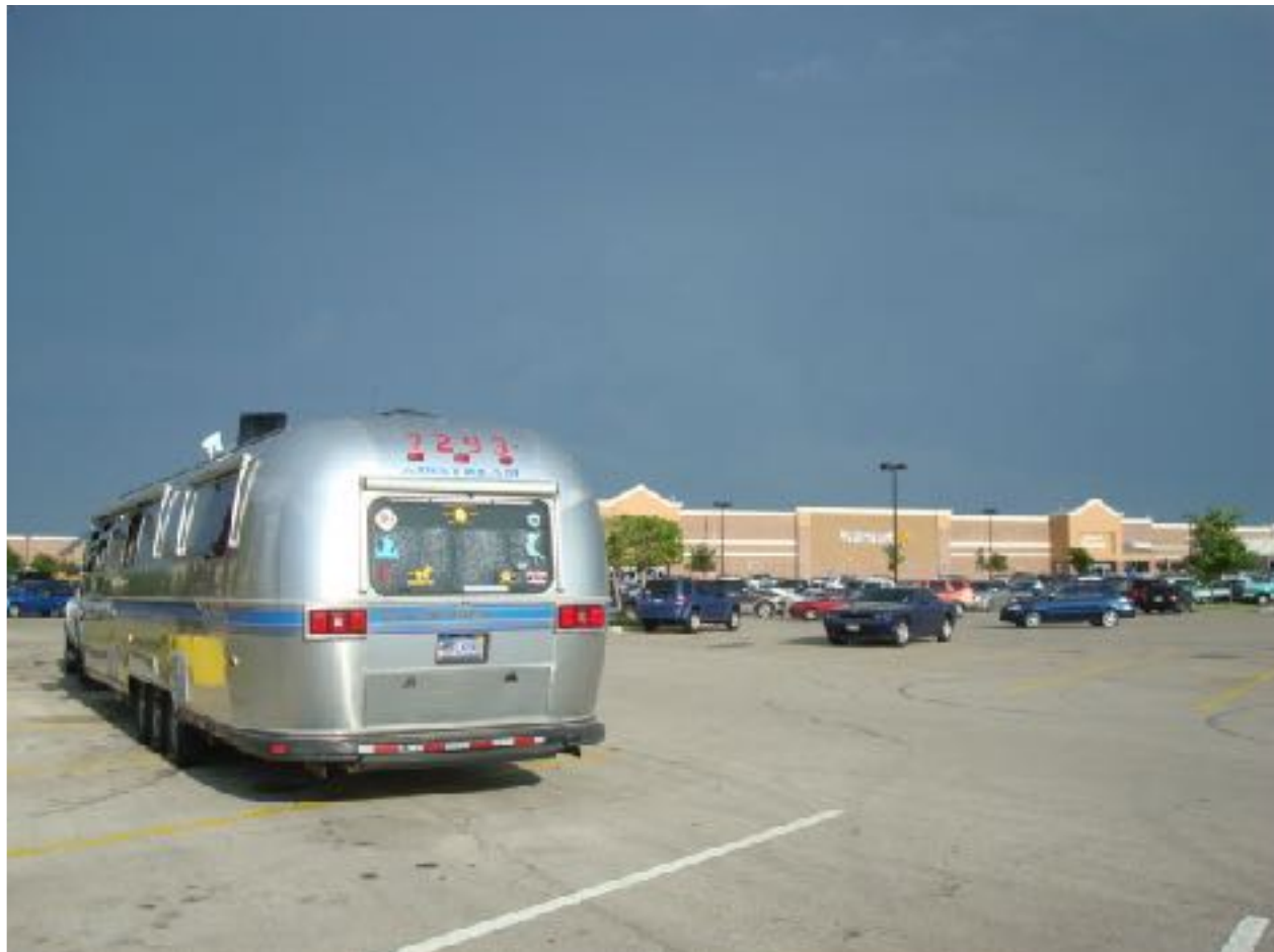
Wal-Mart in Ft Worth, Texas near our daughter's home