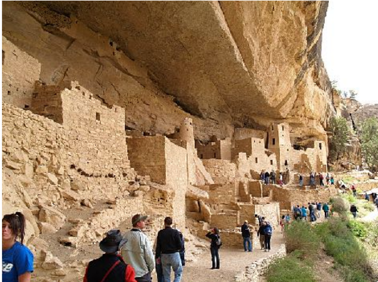
Cliff Palace, Mesa Verde National Park