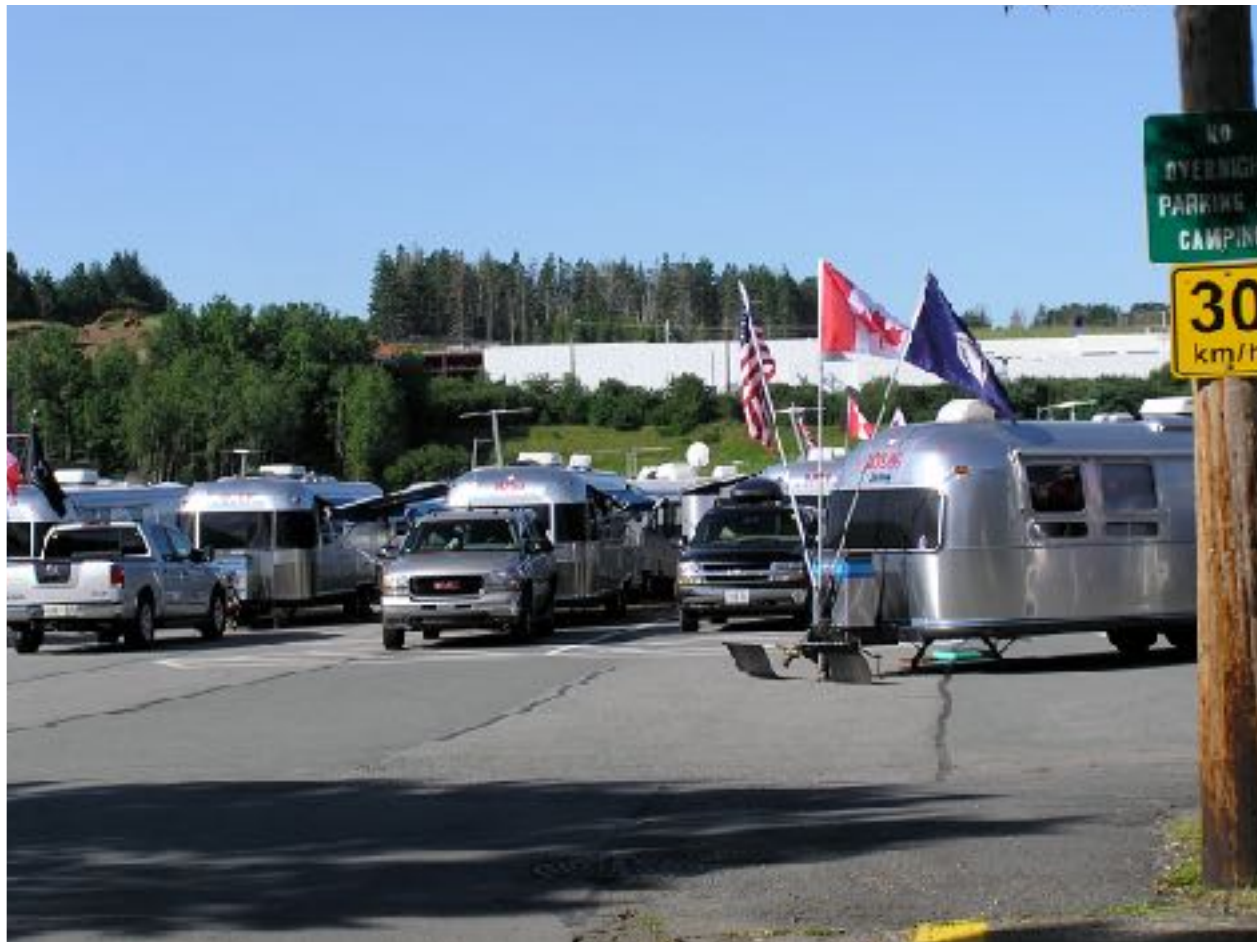
City Parking lot in Lunenburg, N.S. on Nor' by Nor' East Caravan