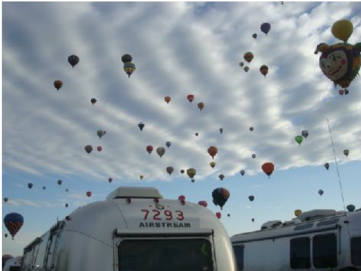
Albuquerque Balloon Fiesta