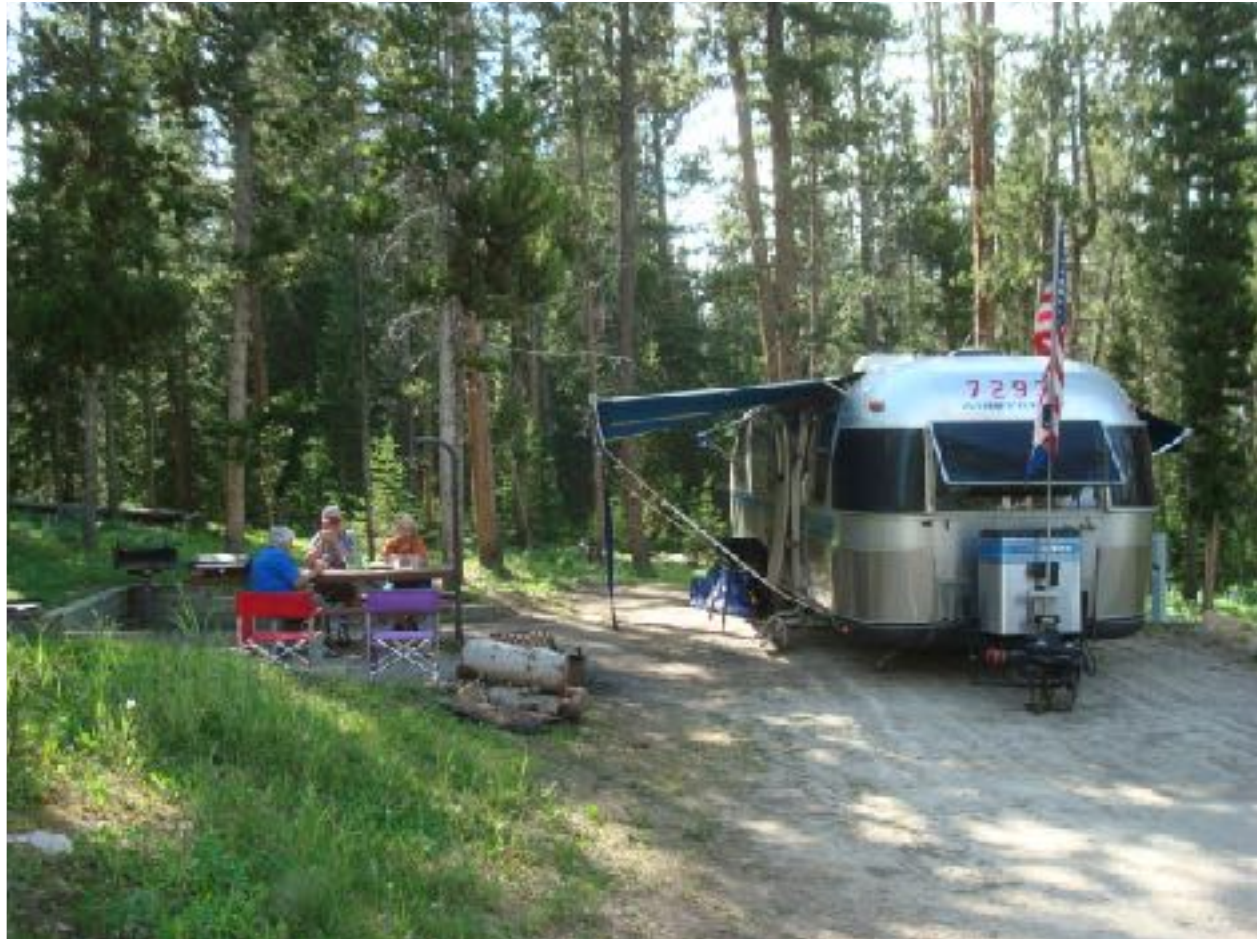
Bighorn National Forest near Sheridan, Wyoming