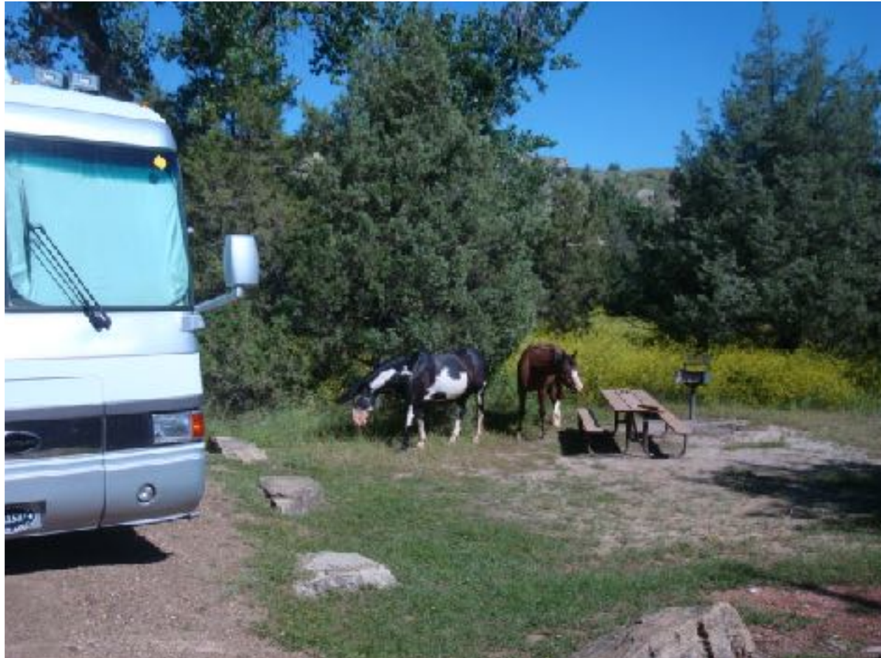
Wild Stallions at Theodore Roosevelt National Park, near Medora, North Dakota