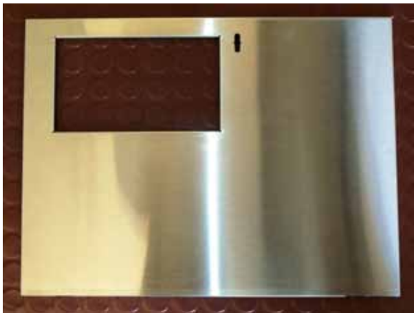
Water heater door-PN: 39765W-02