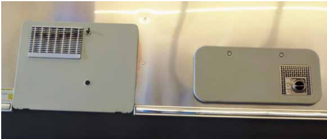
Current Atwood Water Heater and Furnace Doors

We also have developed a Stainless steel Range exhaust vent in lieu of the current plastic version.