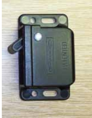
Grabber catch latching mechanism