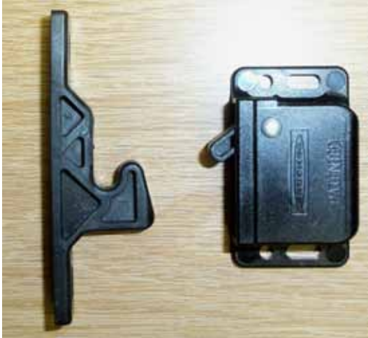
Grabber Catch Complete Assembly