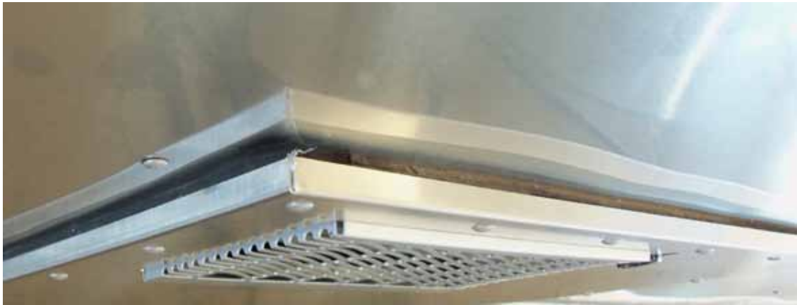
3/16" flange on edge of door to cover appliance frame

If you have any questions about any of these items call 937 596 6111 ext. 7400 or 7416.