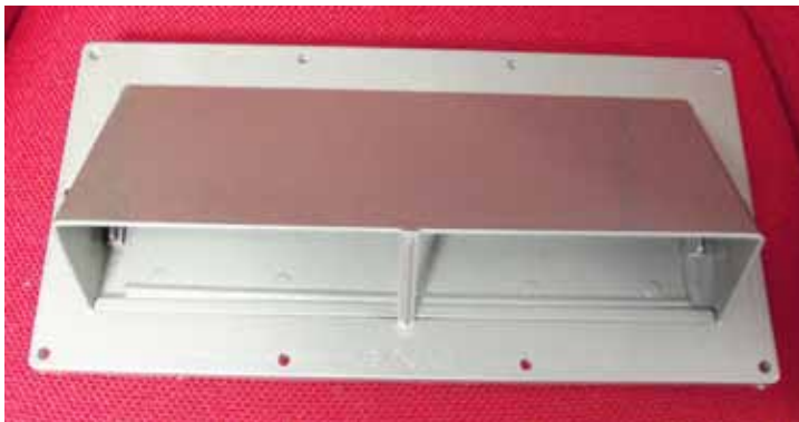
Current Plastic vent SOUTHCO Grabber Catch Assemblies