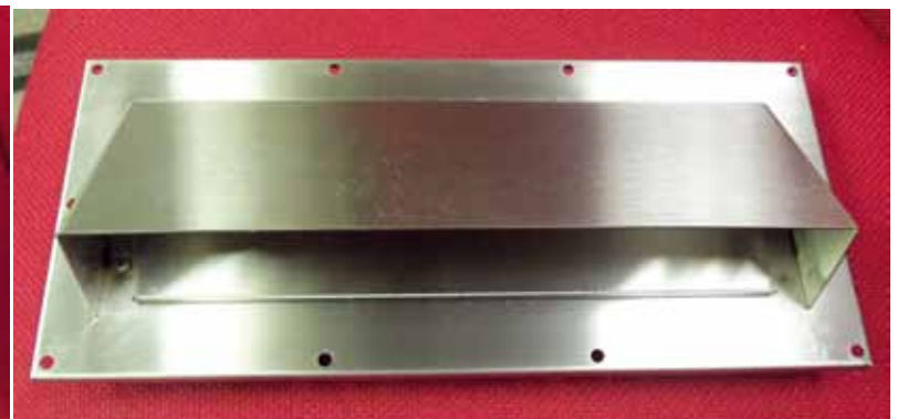
Alternative Stainless Steel Range vent PN: 39763W

Based on customer requests we will now be selling the locking mechanism and the J latch hook separately. You still will be able to order a complete set or order separately for both the 3lb. and 10lb. latches.