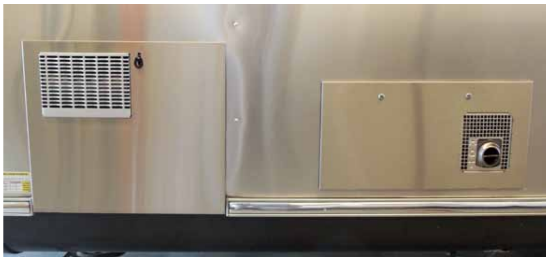
Stainless Steel Alternative Water Heater and Furnace Doors

Water heater door -PN: 39765W-02 Furnace Door -PN: 39764W-02