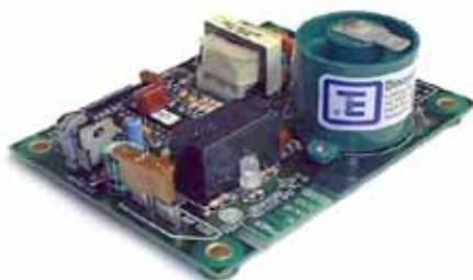
Figure (11) Furnace Circuit Board

When the temperature gets below the set point, the contacts close and apply 12 volt power to both the circuit board and a heavy duty relay. The relay starts the air flow by applying power to the motor. Power is also applied to the circuit board, Figure (11), which controls timing, motor functions and gas ignition. A furnace requires some special timing since we