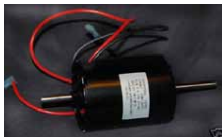
Figure (8) Blower Motor

This is accomplished by using one motor with a double shaft, Figure (8) and two different type squirrel cage blower blades, Figures (9) and (10), both having their own separate housings.