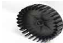
Figure (9) Combustion Blower

This is accomplished by using one motor with a double shaft, Figure (8) and two different type squirrel cage blower blades, Figures (9) and (10), both having their own separate housings.