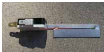
Figure (12) Furnace Sail Switch

The timing circuit keeps the blower running for about 15 seconds to purge the combustion and air chamber. A sail switch is included, Figure (12), which monitors the interior air flow to insure that the burner cannot be lit unless air is circulating through the heat ducts.