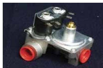
Figure (13) Furnace Gas Valve

With the sail switch closed, power will be supplied to the gas valve, Figure (13). Similar to the water heater "eco" a high temperature limit switch in series with the gas valve, Figure (14), and is normally in the closed position. If the furnace overheats, this switch will open and cut off the propane supply by removing power from the gas valve solenoid.