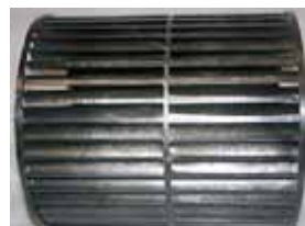
Figure (10) Circulation Blower

The combustion chamber is isolated from the RV interior and uses the smaller blower to draw air in and exhaust the burned gases. This chamber provides the heat for the air flow going through the interior duct system. A much larger squirrel cage blower is needed for the large volume of interior air