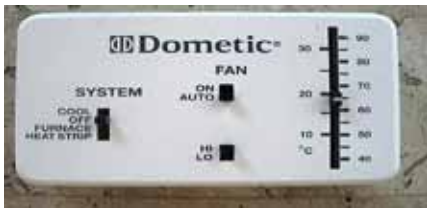
Figure (16) Analog Thermostat

When the thermostat senses that the set point has reached the proper temperature, it will open the switch removing power from the ignition system and turning off the gas valve. The blower will run for about 90 seconds clearing out the air and combustion chamber and then automatically shut down the system.