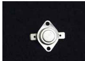
Figure (14) High Temperature Limit

Once the gas valve has opened the circuit board generates a high voltage which is used to automatically light the gas burner through a spark probe, Figure (15). There are two types of spark generators each with a thermocouple, much the same as the water heater. Again the thermocouple must be in the flame in order to generate the millivolt signal that tells the circuit board to keep the gas valve open and thus the burner operating.