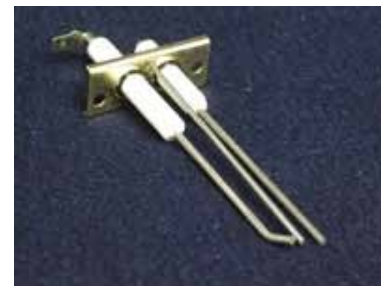
Figure (15) Furnace Spark Probes

If the thermocouple does not detect a burning flame within 6 or 7 seconds, then the valve will automatically be turned off, effectively turning off the gas supply. After a 25 sec purge of gases and any leftover propane from the combustion