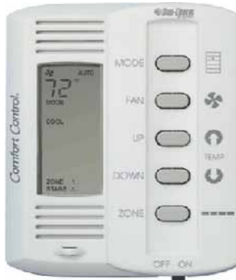
Figure (17) CCC Digital Thermostat

correctly and you learn how to use it, the CCC, illustrated in Figure (17), provides the ultimate in RV comfort.